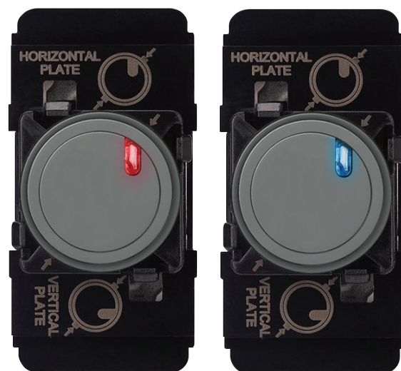
Grey push button with Red and Blue LED