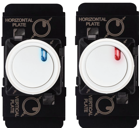
White push button with Red and Blue LED